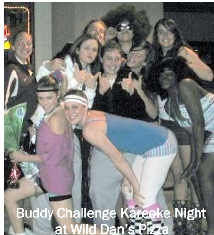
Buddy Challenge Karaoke Night at Wild Dan's Pizza

"Let's not limit our challenges, instead, let's challenge our limits!"